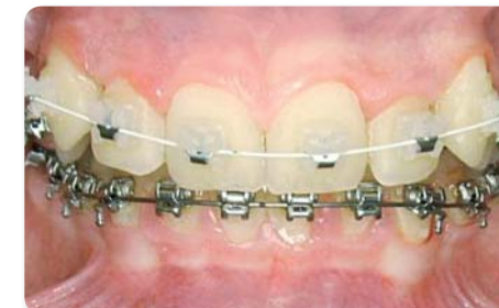
Perfect aesthetics with Titanol® Cosmetic archwires

The precisely rounded slot edges of the QuicKlear® and QuicKlear®>2.0® brackets even allow the use of tooth-shade coated archwires. To date, these archwires were not recommended for metal and ceramic slots due to their sensitive surfaces. To achieve perfect aesthetics in the maxilla we recommend the use and regular replacement of tooth-shade coated Titanol® Cosmetic archwires – they should not be bent as this may damage their coating. BioStarter® and BioTorque® archwires, recommended for extended intervals or compensatory bending, provide for minimal forces, reduced friction and perfect force transmission.