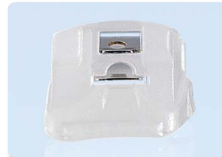
Distinctive funnel for easy opening of the QuicKlear® brackets

gingival aspects. The new guidance channels and a newly developed, distinctive funnel facilitate opening with a probe from the gingival aspect. As previously, the clip can be closed by exerting gentle finger-pressure. The reliable clip made of highly elastic chromium-cobalt alloy is virtually invisible due to its small dimensions.