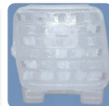
Bracket base after debonding a QuicKlear® bracket