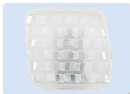
New inverse hook-style base