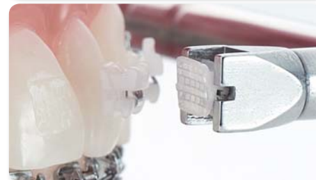
Splinter-proof debonding with the QuicKlear® bracket removing tool