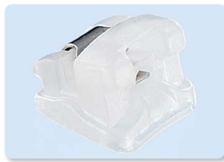
Occluso-gingival edge on the bracket base prevents adhesive flowing into the clip mechanism

FORESTADENT based the development of the new QuicKlear® brackets on nature. A new ceramic mixture was created which matches the patient's natural tooth shade perfectly. This ensures that QuicKlear® brackets are perfectly camouflaged and can only be spotted when looking closer.