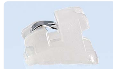
Rounded slot edges and a four contact point slot provide minimal friction